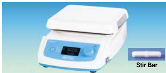
B. “MaXtir™ MSH500” Unit only