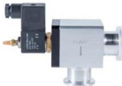
Vacuum Solenoid Valve