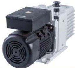
Premium Vacuum Pump