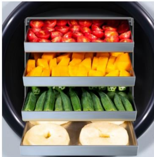
Before Freeze Drying