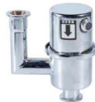
Vacuum Inlet Dust Filter