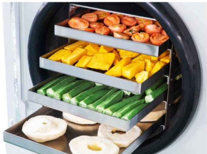
After Freeze Drying