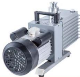
Standard Vacuum Pump