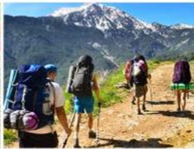
CAMPING & HUNTING