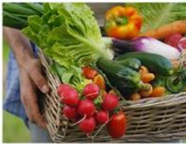
GARDEN & DRCHARD