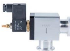
Vacuum Solenoid Valve