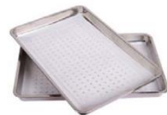
Non-stick Silicone Food Mat