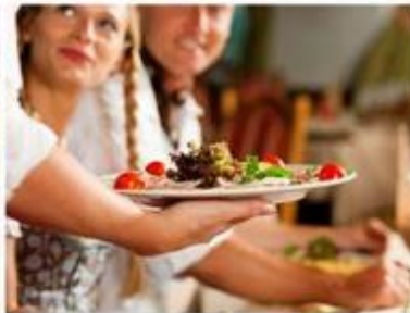
SNACK BAR & FOOD SHOP